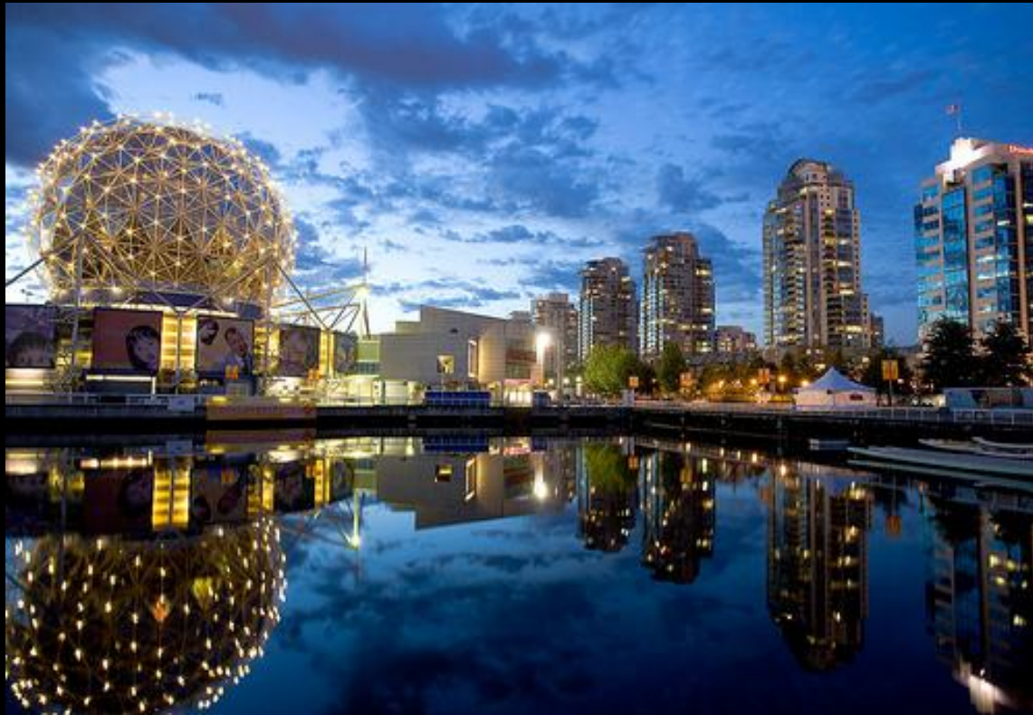
Photography: The Telus World of Science by kennymatic

“Two-parent sex appeared on the scene about 500,000,000 years ago.”