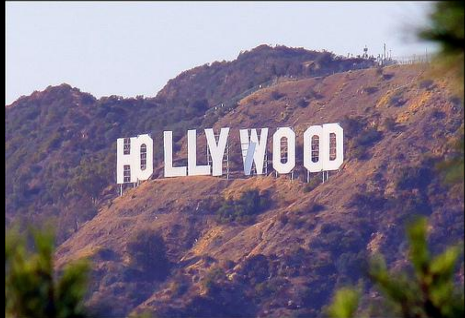
Photography: Hollywood by loop_oh