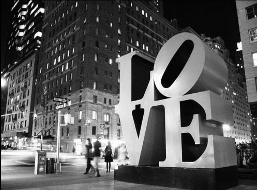
Photography: Love, Midtown, New York City, NY

“Sex relieves tension - love causes it.”