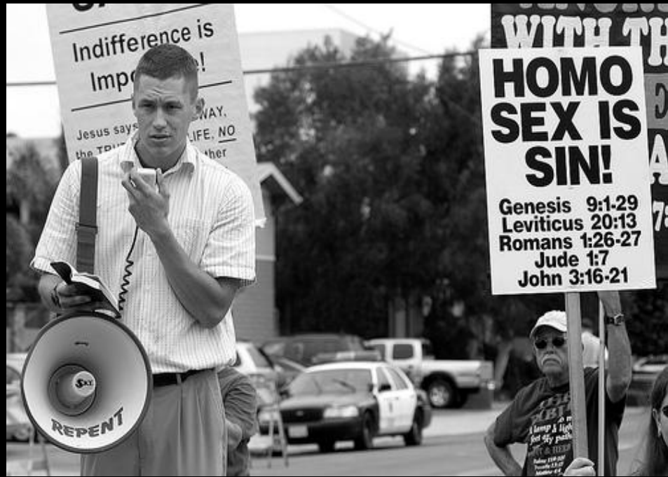
Photography: Protesters by scragz