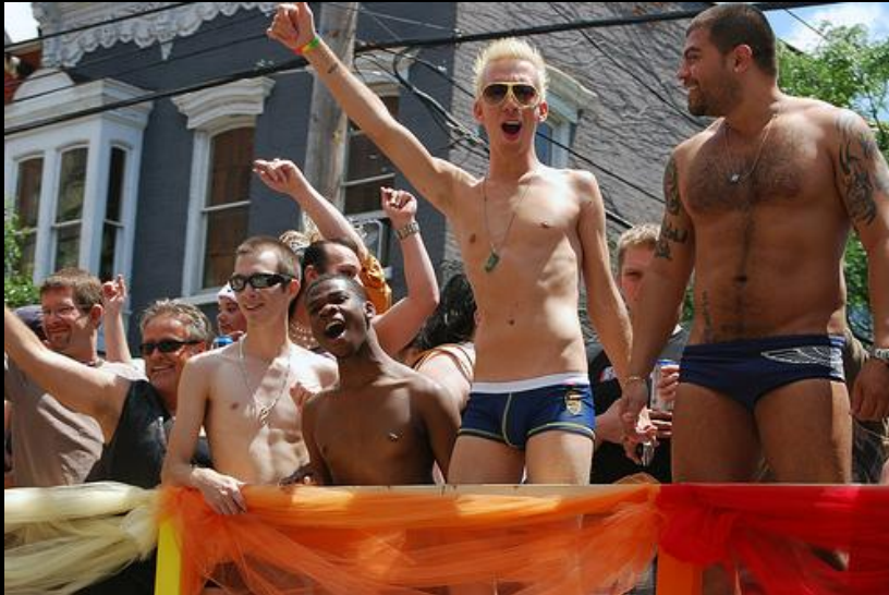
Photography: Capital Pride Parade, Albany NY 2009 by albany_tim

“Homosexuality is God's way of insuring that the truly gifted aren't burdened with children.”