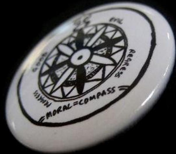
Photography: moral.compass by dphilhawksworth