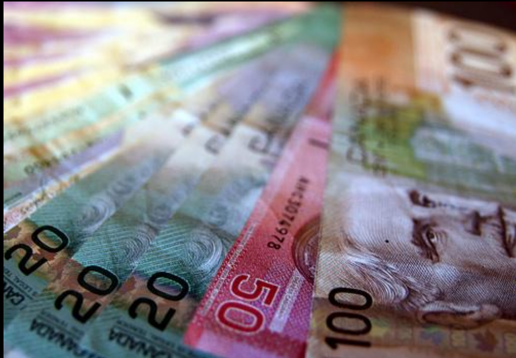
Photography: Money by duckiemonster