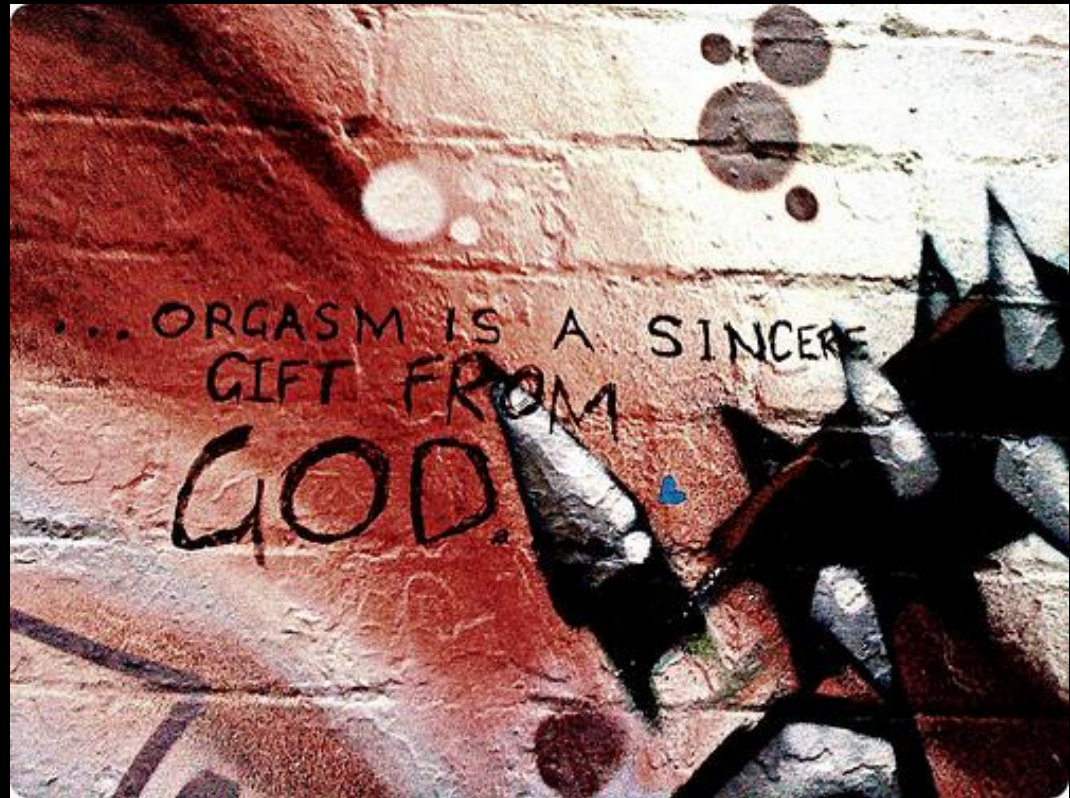
Photography: ...orgasm is a sincere gift from GOD. by M i x y