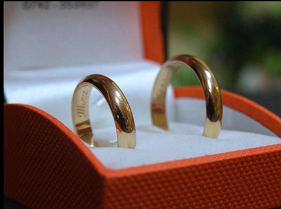
Wedding's Rings

“The main problem in marriage is that for a man sex is a hunger like eating. If the man is hungry and can't get to a fancy French restaurant, he goes to a hot dog stand. For a woman, what is important is love and romance.”